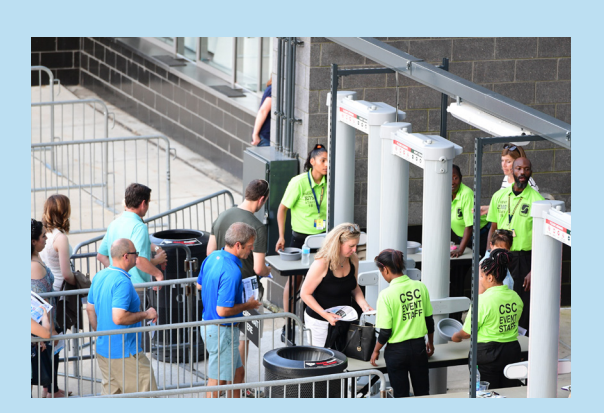
Figure 8. Bag search lines with barriers (Contemporary Services Corporation)