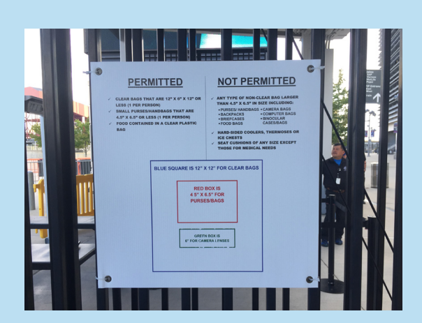
Figure 9. Permitted and not permitted item signage (MetLife Stadium)

✓ In general, a bag search line is always recommended for all individuals entering the venue. Venues may defer to the pre-event evaluation threat assessment to determine whether non-bag search lines are appropriate.