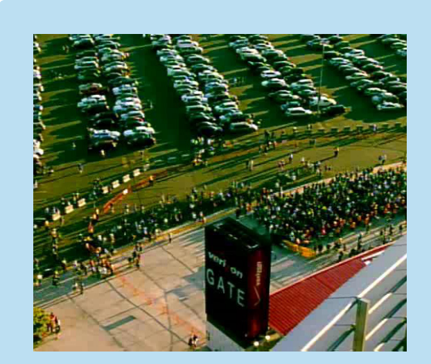
Figure 4. Lines prior to security gate (MetLife Stadium)