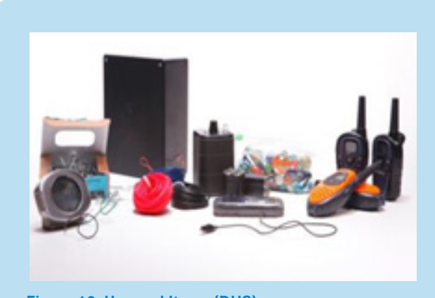
Figure 10. Unusual Items (DHS)

hard coolers, umbrellas, backpacks and multi-pocketed bags over a specified size, pepper spray containers, or air horns).