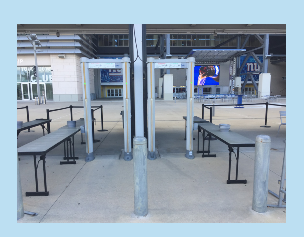
Figure 6. Bag search location (MetLife Stadium)