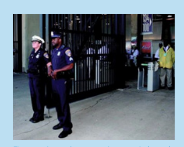
Figure 11. Law enforcement placement in front of ticket collection (DHS)

It is recommended that bag searchers or other event staff remain alert of suspicious activities by attendees (e.g., not making eye contact when spoken to by bag searcher(s), acting extremely nervous, or making attempts to avoid security), along with concealing items underneath their clothing. These behaviors may warrant a one-on-one discussion with that individual and event security staff or law enforcement.