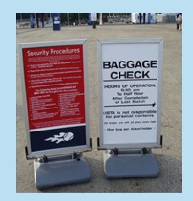
Figure 3. Perimeter signage (U.S. Tennis Assn.)