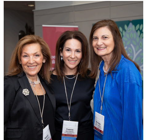
2024 Women's Philanthropy Community Event